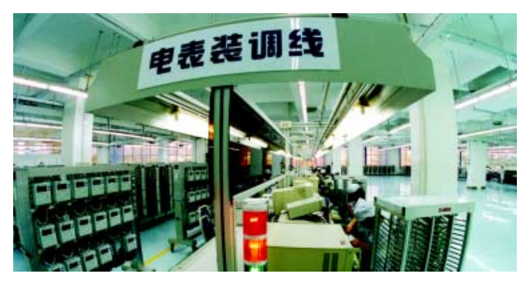
Meter Assembly Line