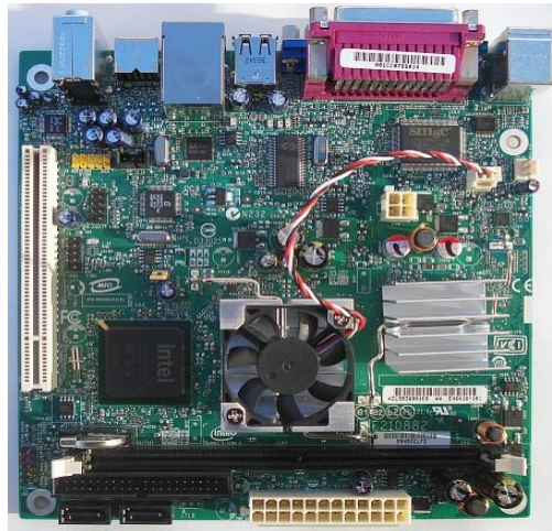
Figure 1. Intel Atom motherboard includes a fan for heat dissipation [8]

To increase performance, Atom also supports Hyper-Threading. Hyper-Threading is Intel's proprietary technology that implements simultaneous multi-threading. For each processor core that is physically present, the operating system can create two virtual processors and shares the workload between them. Hence a dualcore Atom, such as the N330, appears to have four cores to the operating system [7]. Finally, in order to support the multimedia operations, the Atom is commonly paired with a 945G chipset that further increases both its performance and power consumption.