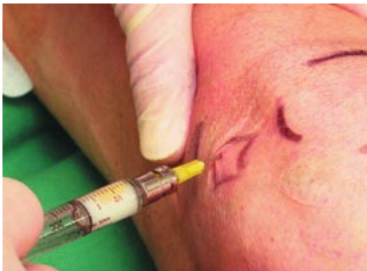
FIGURE 1. Top, arthrocentesis of the knee joint via the usual medial entry. Bottom, actual injection of corticosteroid suspension into knee via medial approach.

All injectable corticosteroids except cortisone and prednisone can promptly and significantly reduce inflammation in an inflamed joint. The more soluble the corticosteroid, the more rapidly it is absorbed and the shorter the duration of effect. Tertiary butyl acetate (TBA, tebutate) is an ester form that prolongs the duration of action of the compound as a result of decreased solubility, which probably causes its dissociation by enzymes to proceed more slowly.