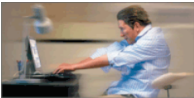
Figure 1: A magazine advertisement for highspeed internet (TDC Online). The stream of information from the internet is literally almost blowing the user away, but he is desperately clinging on. The ad serves both as a touting and a warning since he would obviously disappear if he raised his hands from the keyboard.

Consumers are told – both verbally and visually (see Figure 1) – that if information is good, more information is better, and if they don't follow they will be left behind.