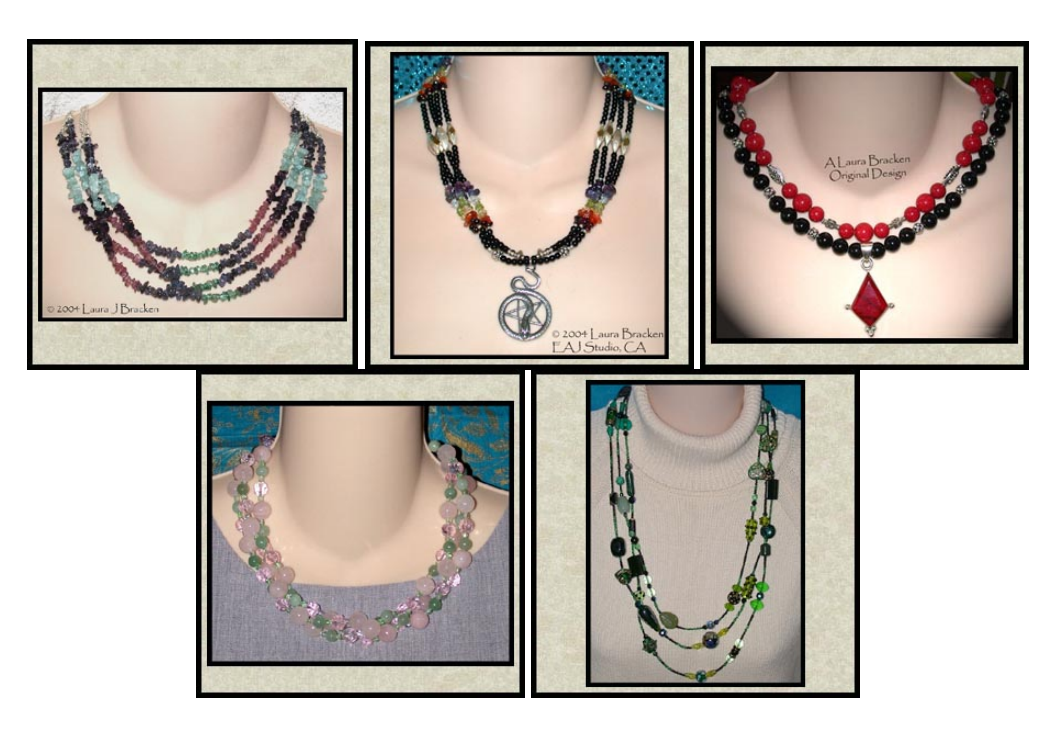
(Hit your BACK button to return to previous menu)