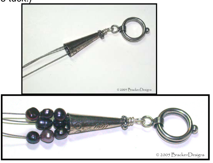
Step 7: String the rest of your necklace/bracelet

Step 6: Slip one end of your clasp set onto this loop and finish wrapping (including the tuck!)